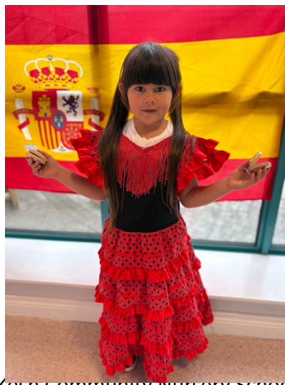
Kesri Community Nursery School